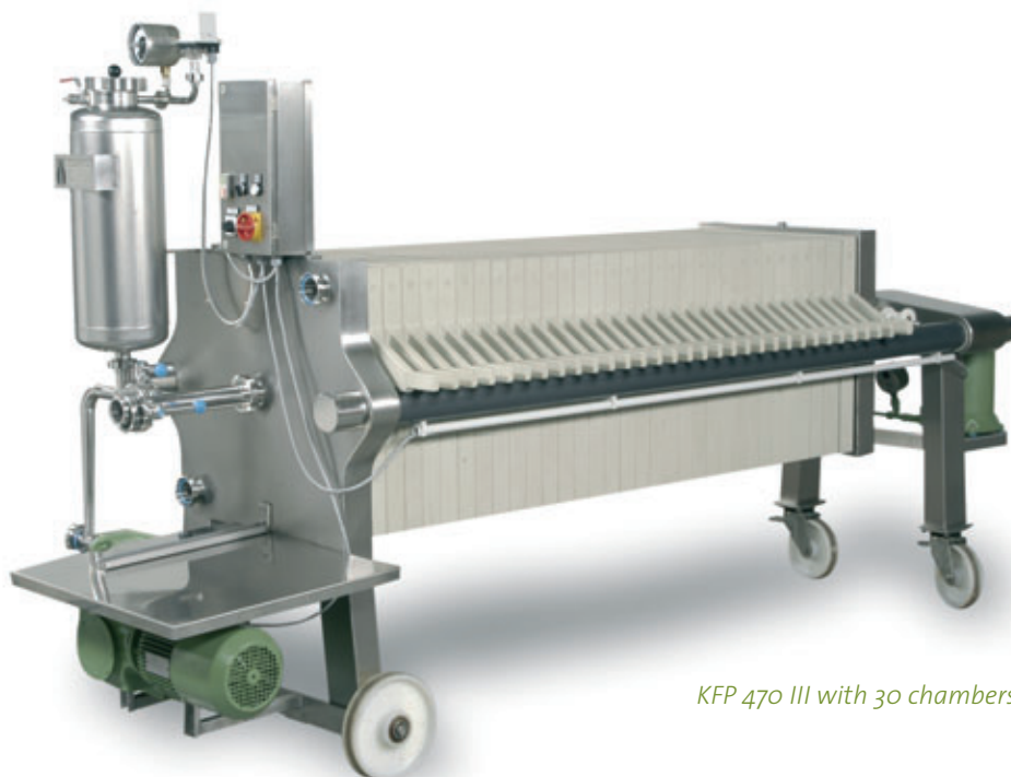
KFP 470 III with 30 chambers

The filter plates are of polypropylene although other materials are also possible as required. The filter cloths are generally also made of polypropylene.