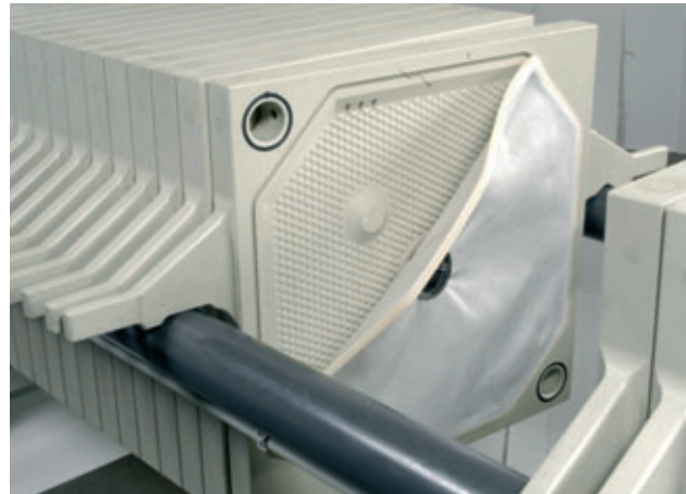
Chamber plate Clean System and cloth with integrated rim seal (patented)

Filters remain clean and aseptic on the outside.